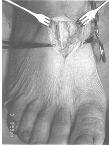
Fig. 5. An intra-operative view of the deep peroneal nerve after resection of the extensor hallucis brevis tendon.

ligament should be visible, and care should be taken to recognize the intermediate (Lemont's) and medial dorsal cutaneous nerves superficially [22]. The superiomedial and inferiomedial limbs of the inferior extensor retinaculum are divided. The deep peroneal nerve and the anterior tibial artery are identified. The deep peroneal nerve along with the lateral and medial branches is neurolysed. An exploration for osteophytes, scar tissue, lesions and masses is performed and removed if located. The portion of the extensor hallucis brevis tendon that crosses the deep peroneal nerve is bovied and resected (Fig 5). Using microsurgical instruments and technique, the epineurium is opened. If there is intraneural fibrosis present, an internal