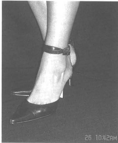
Fig. 2. A strap from a dress shoe can cause compression to the anterior ankle.

The medial branch travels to the first intermetatarsal space along the course of the dorsalis pedis artery which is located between the extensor hallucis longus tendon and the medial border of the extensor hallucis brevis muscle, where it pierces the deep fascia at the first webspace. At this point, it divides into two cutaneous nerves, which supply the medial aspect of the hallux and the lateral aspect of the second digit [8,9].