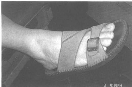
Fig. 1. A strap from a sandal can cause compression over the deep peroneal nerve.

The deep peroneal nerve arises as a branch of the common peroneal nerve which courses around the neck of the fibula. The deep peroneal nerve enters the anterior compartment of the leg after it passes deep to the peroneus longus muscle and then flows obliquely forward beneath the extensor digitorum muscle. It then travels distally along the anterior surface of the interosseous membrane. In the upper one-third of the leg, the deep peroneal nerve is located between the extensor digitorum longus and the anterior tibialis muscles, and passes inferior to the extensor hallucis longus tendon in the lower one-third of the leg. The nerve is lateral to the anterior tibial artery and between the extensor hallucis longus and the extensor digitorum longus tendons, just proximal to the ankle joint. It then commonly divides into medial and lateral terminal branches about 1.3 cm above the ankle joint [8,9].