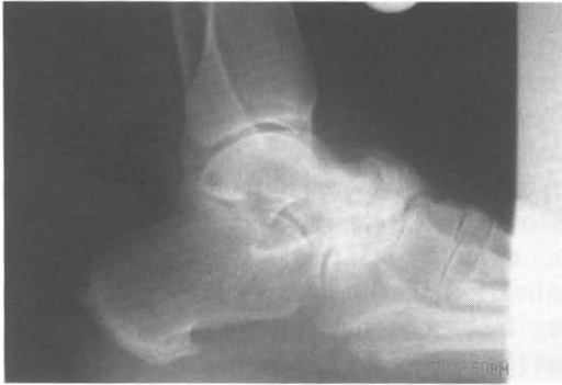
Fig. 4. Radiograph shows talar navicular exostosis, which causes compression to the deep peroneal nerve.

Initial non-operative treatment consists of patient education, pharmaceutical agents, local injections, physical therapy, and patient lifestyle modifications such as shoe wear and activity. Orthotics or accommodative shoes can help decrease the pressure over the nerve [20]. Different shoe gear, alternative lacing techniques, or appropriate padded areas may also accommodate the nerve. Patients who have recurrent ankle sprains and loss of proprioception might benefit from physical therapy to strengthen the peroneal muscles and improve ankle joint proprioception. Anticonvulsant or tricyclic antidepressant medications can diminish the neuritis and can be used in conjunction with pressure relieving treatment.