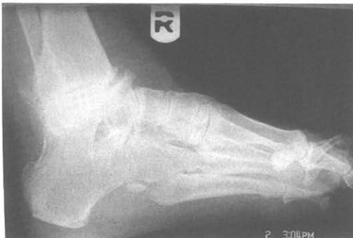
Fig. 3. Radiograph shows tibial talar exostosis, which causes compression and anterior tarsal tunnel syndrome.

It is very important to distinguish between an entrapment of the superficial peroneal nerve and the deep peroneal nerve. The superficial peroneal