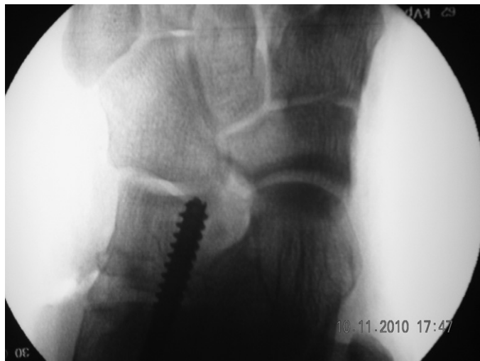
Fig. 5. Inferior dual lag-positional screw placed so that threads are distal to proximal slide osteotomy.