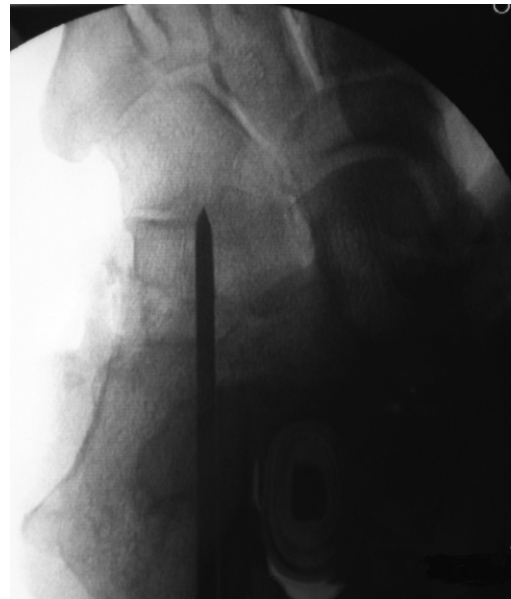
Fig. 4. Intraoperative fluoroscopy verifying correct positioning of guidewires.