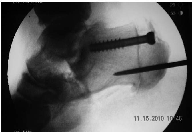
Fig. 2. Proximal (superior), partially short-threaded cannulated screw placed over first guidewire and lagged across translated posterior capital fragment of calcaneus to provide interfragmentary compression.

A partially long-threaded cannulated screw is inserted over the guidewire and driven across both calcaneal osteotomies and the bone graft. The inferior dual lag-positional screw is placed such that the threads are distal to the proximal slide osteotomy, thus providing interfragmentary compression, and concomitantly engaging the bone proximal to the Evans osteotomy, the bone graft, and the anterior process of the calcaneus ( Figure 5 ). This partially long-threaded dual function screw provides excellent compression across the posterior capital fragment and acts as a positional screw, maintaining the length of the lateral column and not providing compression across the interpositional graft ( Figure 6 ).