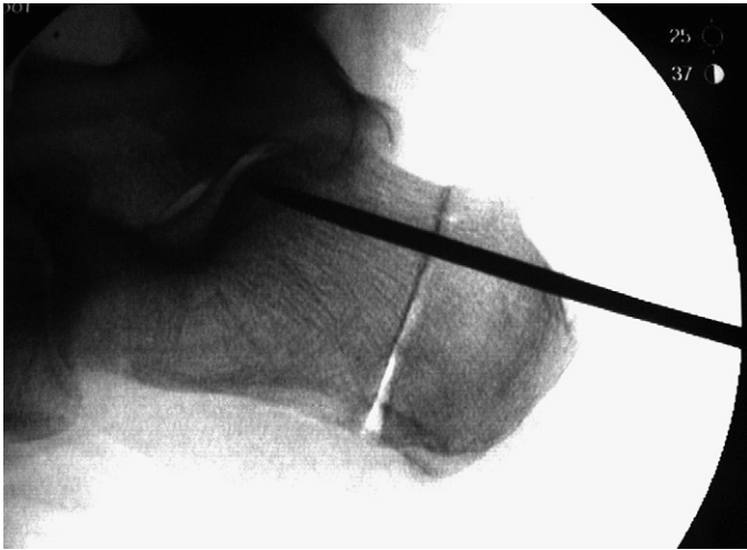
Fig. 1. Guidewire placed in superior one half of calcaneus to achieve temporary fixation.

The second guidewire is then placed in the inferior one half of the calcaneus, oriented from proximal-inferior-central to distal-superior-lateral, crossing slightly oblique to the posterior capital fragment and extending into the anterior process of the calcaneus. The position is checked with fluoroscopy. The wire driver is placed on reverse, and the second (inferior) guidewire is repositioned such that the tip of the wire is approximately 3.0 cm proximal to the calcaneal cuboid joint. Attention is then directed to the lateral rear foot, where an Evans calcaneal osteotomy is completed approximately 1.5 cm proximal to the calcaneal cuboid joint and just distal to the previously positioned inferior calcaneal guidewire. The anterior capital fragment of the calcaneus is distracted to reduce forefoot abduction and better align the forefoot and midfoot with the rear foot. An appropriate custom-size trapezoidal wedge composed of a tricortical cancellous bone (allogeneic or autogenous) graft is oriented with the base, laterally and medially. This is then sculpted and tamped into the Evans osteotomy. According to patient size and surgeon preference, the selection of the size of the cancellous screw is determined for the most proximal screw. The proximal (superior), partially short-threaded cannulated screw is placed over the first guidewire and lagged across the translated posterior capital fragment of the