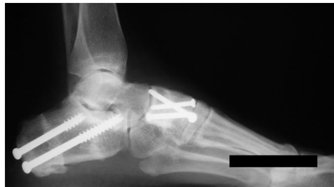
Fig. 6. Follow up radiograph showing long-threaded dual function screw providing excellent compression across posterior capital fragment and acting as positional screw.

A variety of fixation techniques have been reported for the double calcaneal osteotomy (1, 2, 8, 9, 11). However, revision is often required because of pain caused by bony nonunion (12). We have illustrated a technique using single-screw fixation that provides positional and compressive qualities about the osteotomy sites. This technique has specific advantages compared with other fixation methods, including increased lag effect across the posterior capital fragment of the calcaneus and positioning effect across the bone graft and anterior capital fragment of the calcaneus. Furthermore, the position of the screw across the graft site maintains its position by preventing subsidence, extraction, and dorsal migration. In conclusion, this method delivers compression across the medial calcaneal displacement osteotomy while acting as a buttress across the Evans distraction osteotomy. A paramount advantage of this fixation technique is that it is essentially intramedullary and eliminates the need for additional soft tissue dissection, decreasing the potential for wound and vascular injury to the local site. Technically, this procedure also eliminates the need for the more expensive use of plate fixation, thereby decreasing the probability of the need to remove painful